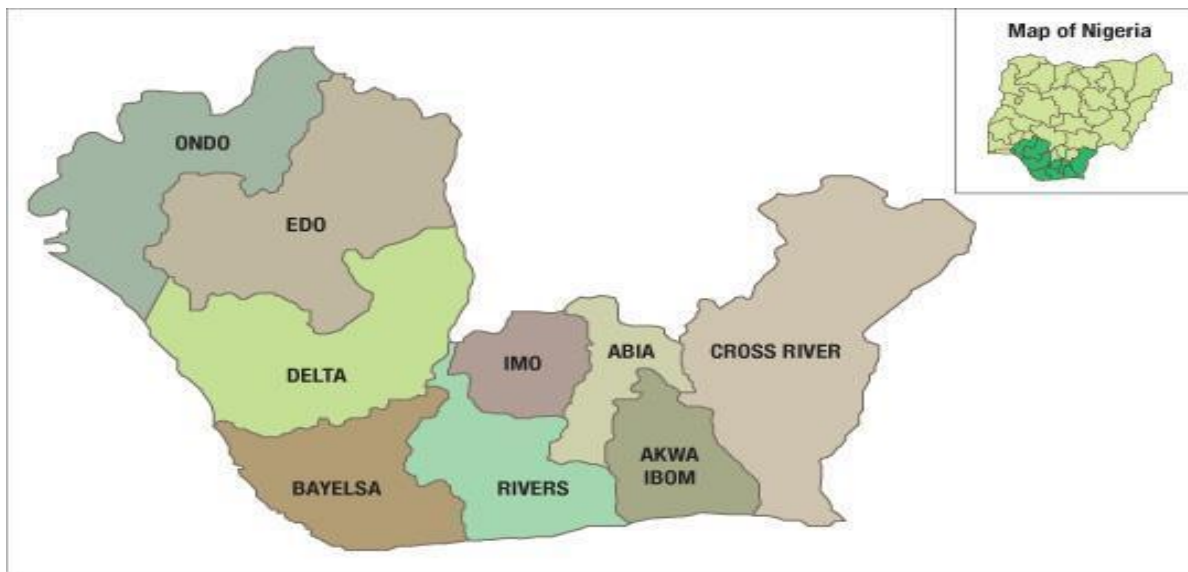
Fig. 1: Map of the Niger Delta Region (Niger Delta Development Commission).

The Niger Delta is home to different ethnic configurations such as igbo, Ijaw, Ibibio, Urhobo, Annang, Oron, Efik, Ogoni, Abua, Bini, Esan, Isoko, Kalabari, Okrika, Epie-Atissa, and Obolo, amongst others. It is largely an agrarian enclave, which explains why agriculture is the most dominant occupation of the people, with farming and fishing constituting 90 percent of their economic activities. The region is highly rich, yet the majority of its people live in multidimensional poverty, with limited or no access to quality education, portable drinking water, nutritious food, healthcare service delivery, and shelter.